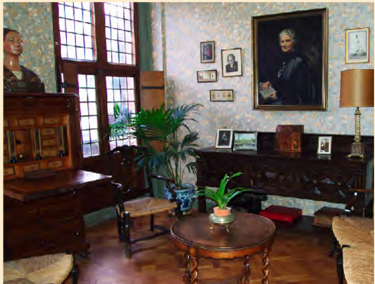
Maria Montessori's Study in Amsterdam