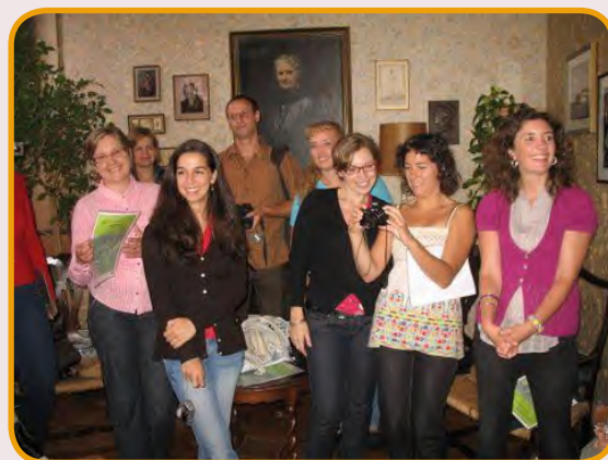
A tour of Maria Montessori's study

We would love to see more visitors and offer them our special hospitality.