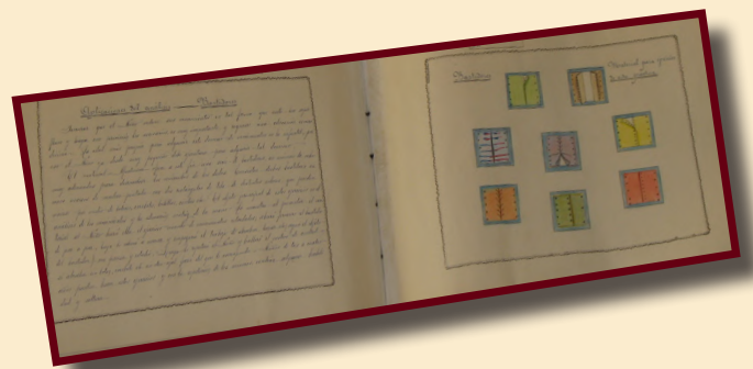
historical albums by Montessori students