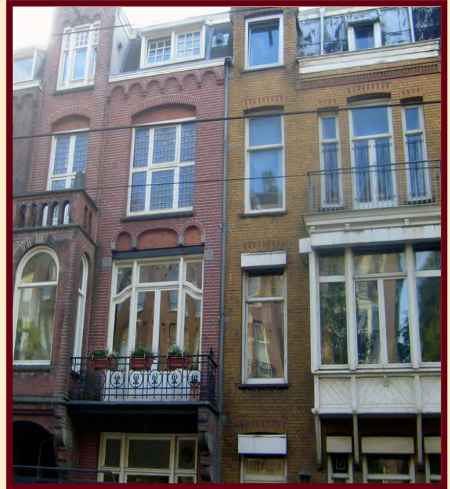
To give you an impression of the two buildings, here is a photo of 161 and 163 together. The one on the left with the red bricks is the Maria Montessori House.